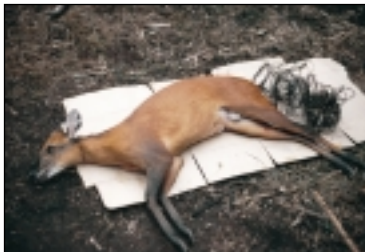
Black-fronted duiker with wire snares.

Large and eye-catching species are the first victims. The majority hunted are hoofed animals and rodents. In Equatorial Guinea, rodents form 32% of meat on the markets, in Liberia, duikers form 75% of the game on offer.